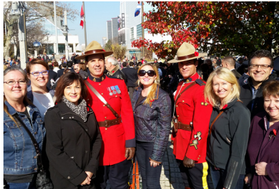
Many Motor City team members observe Remembrance Day on November 11