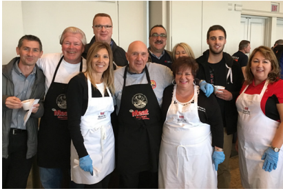
Motor City staff at Chilifest supporting the Windsor Firefighters Benefit Fund