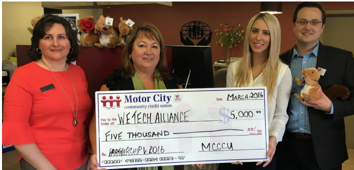
WEtech Alliance Gets Boost from Motor City Community Credit Union as a Tech Titan with a $5,000 sponsorship.