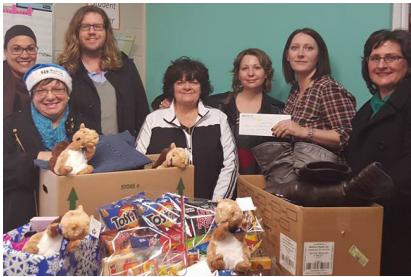
City Centre donates many useful items during the holidays