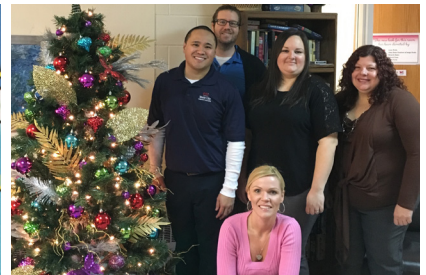
Motor City staff decorates the Welcome Centre Shelter for Women at Christmas