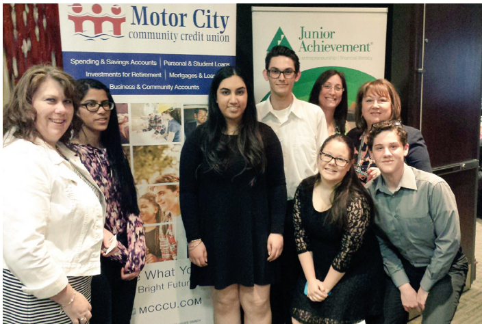
Motor City proud to support Junior Achievement Southwestern Ontario for the second consecutive year.