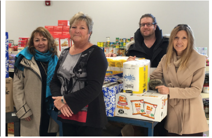
Annual Can Drive donation for Unemployed Help Centre