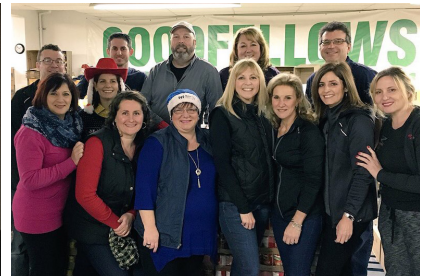
Motor City team at the annual Goodfellows box packing