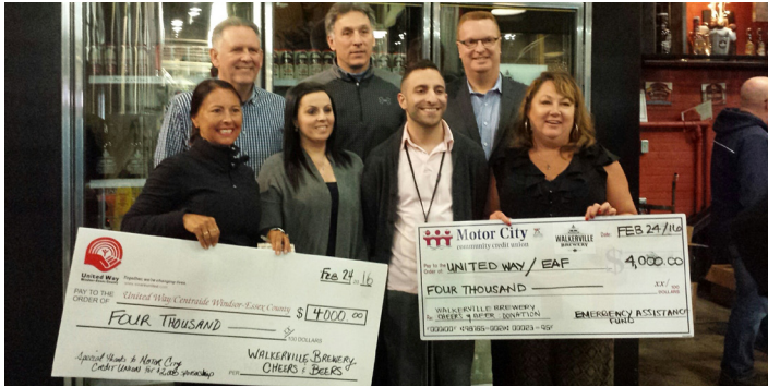
Motor City sponsored Walkerville Brewery's Cheers & Beers event with proceeds donated to United Way's Emergency Assistance Fund.